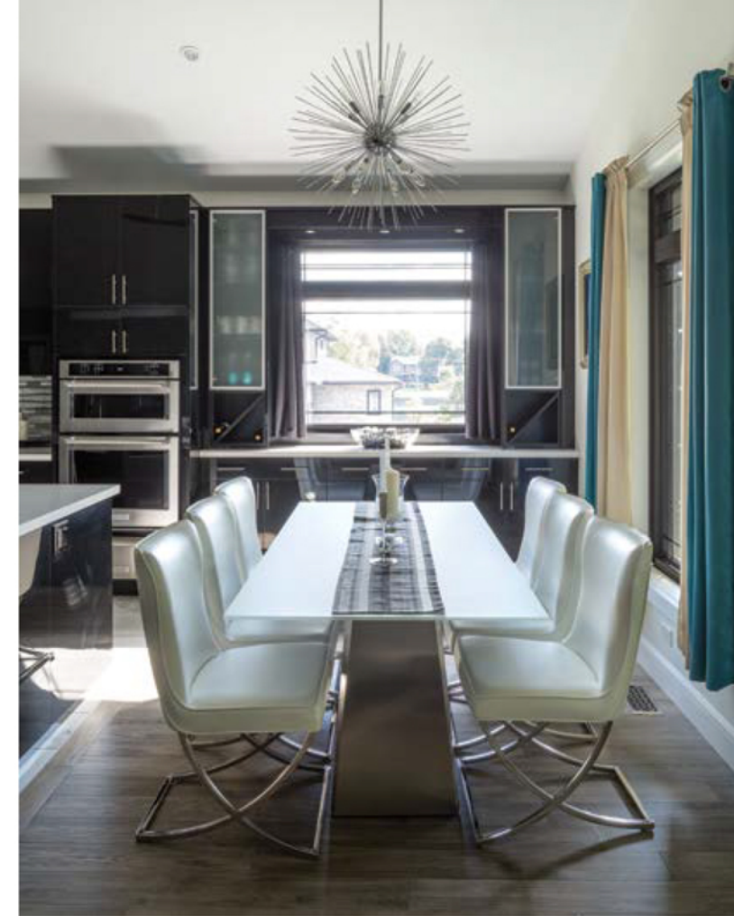
FAR LEFT: AyA Kitchen Designs furnished the glossy black cabinetry for the kitchen, where bevelled glass forms the backsplash. LEFT: The dinner table with matching supple chairs came from Cozy Living Inc. BELOW: A swirl of turquoise in a carpet from Florida adds a splash of colour and inspiration to the modern living space.