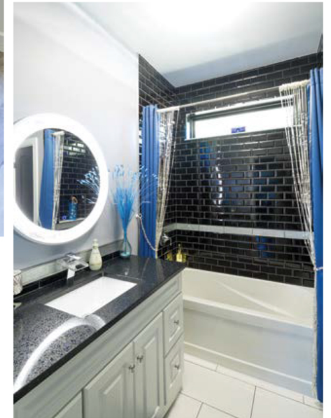
LEFT: Taking their cue from the distinctive décor, the Smiths call their guest room The Red Room. ABOVE: A circular mirror frame helps light up this main floor bathroom. AyA Kitchen Designs supplied the home's bathroom vanities.